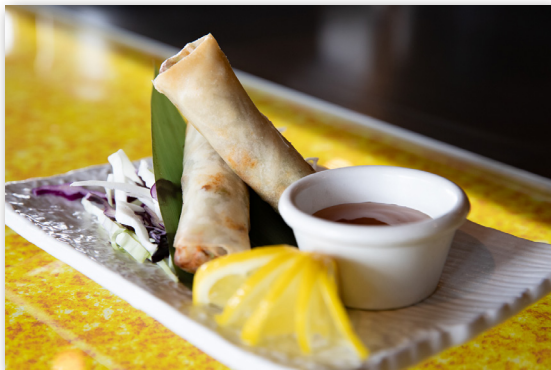
Wagyu Spring Rolls